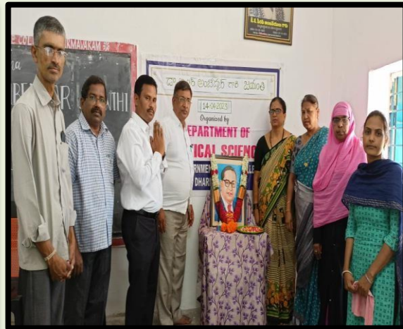
Principal, staff and the students paying tributes by garlanding the portrait of Baba Saheb Ambedkar